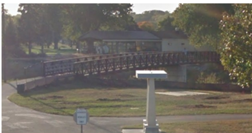
POTENTIAL BRIDGE FOR REUSE AT CHANNEL CROSSING

Since this project is closely connected to the realignment of CSAH 70 being completed by Cass County, schedules are subject to change. Final design of the CSAH 70 realignment is expected to begin in the summer/fall of 2021.