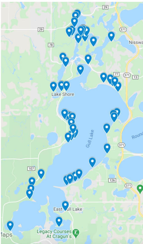
Map of Gull Lake with locations of our

Stewards set the pace for managing their property so as to protect our lakes, and with the beautiful Lake Steward sign on the end of their dock, they influence their neighbors to join in: note the clustering of Lake Stewards on the map. Three of our Lake Steward families are pictured below, our thanks to all of them for protecting our lakes!