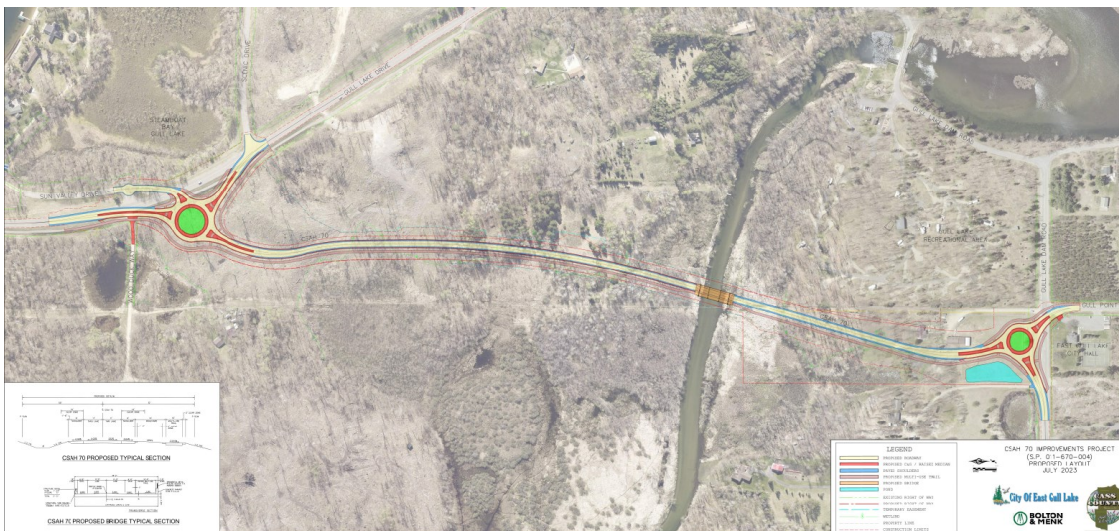
Bolton and Menk rendering of the new County Road 70 project

The impetus for both projects is directly related to Cass County’s realignment of County Road 70. The intention of Cass County is to realign County Road 70 away from the existing United States Army Corp of Engineer (USACE) Dam crossing of the Gull River. The new County Road 70, scheduled to be constructed in late 2023 through Fall of 2024, will begin at the intersection of Gull Point Road and County Road 70 near City Hall and traverse south over a new bridge at the Gull River, and further tie back into the existing County Road 70 near Sun Valley Drive and Wood Duck Way.